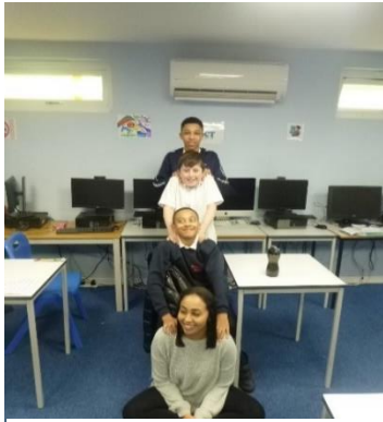
The best message therapists in town!

The summer term has indeed ended very strangely for us! We have all had a great deal to adapt to in terms of learning to work remotely. But your tech savvy children have latched on so easily and super exceeded their own expectations! Even though times are difficult, they have worked exceptionally hard.