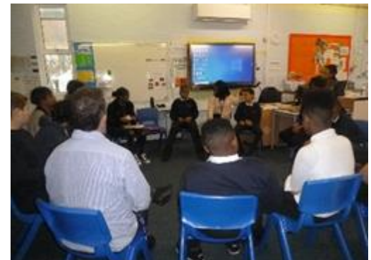
PSHE lesson with Croydon Youth Engagement team

We would like to wish you all a very restful, safe, and sunny summer holiday!