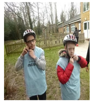
Getting ride for our bike ride!

As for parents, you have been tremendous in your resilience and response, often whilst juggling your own commitments at home. And maintaining your sanity too! Certainly, remote learning has been an interesting and a steep