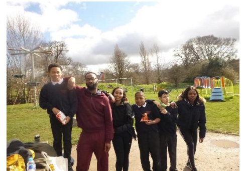
Phew! No Social distancing back then!