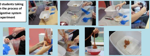
Year 10 students taking part in the process of the digestive system experiment

Some of our students have been working fantastically this term. They have been focusing on biology, with key topics including animal and plant cells, tissues, organs and organ systems. During some of these lessons the students have had the opportunity to take part in experiments to enhance their knowledge.